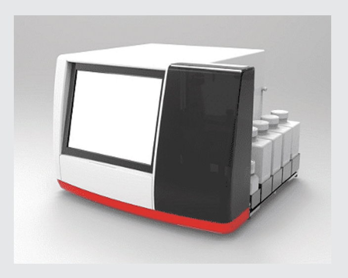
ApoStream Instrument for CTC capture